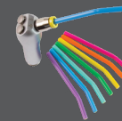
Seal-Tight™ Disposable Air/ Water Syringe Tips

To view a list of all products that qualify for double reward points visit loyalty.kerrdental.com